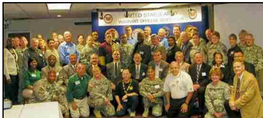
(Group picture of AMM Attendees)

Quality Inn Salt Lake City Airport 1659 West North Temple Salt Lake City, UT 84116 (801) 533-9000